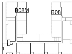
KEY PLAN - B08 & B08M - LEVEL 3, 4, & 5